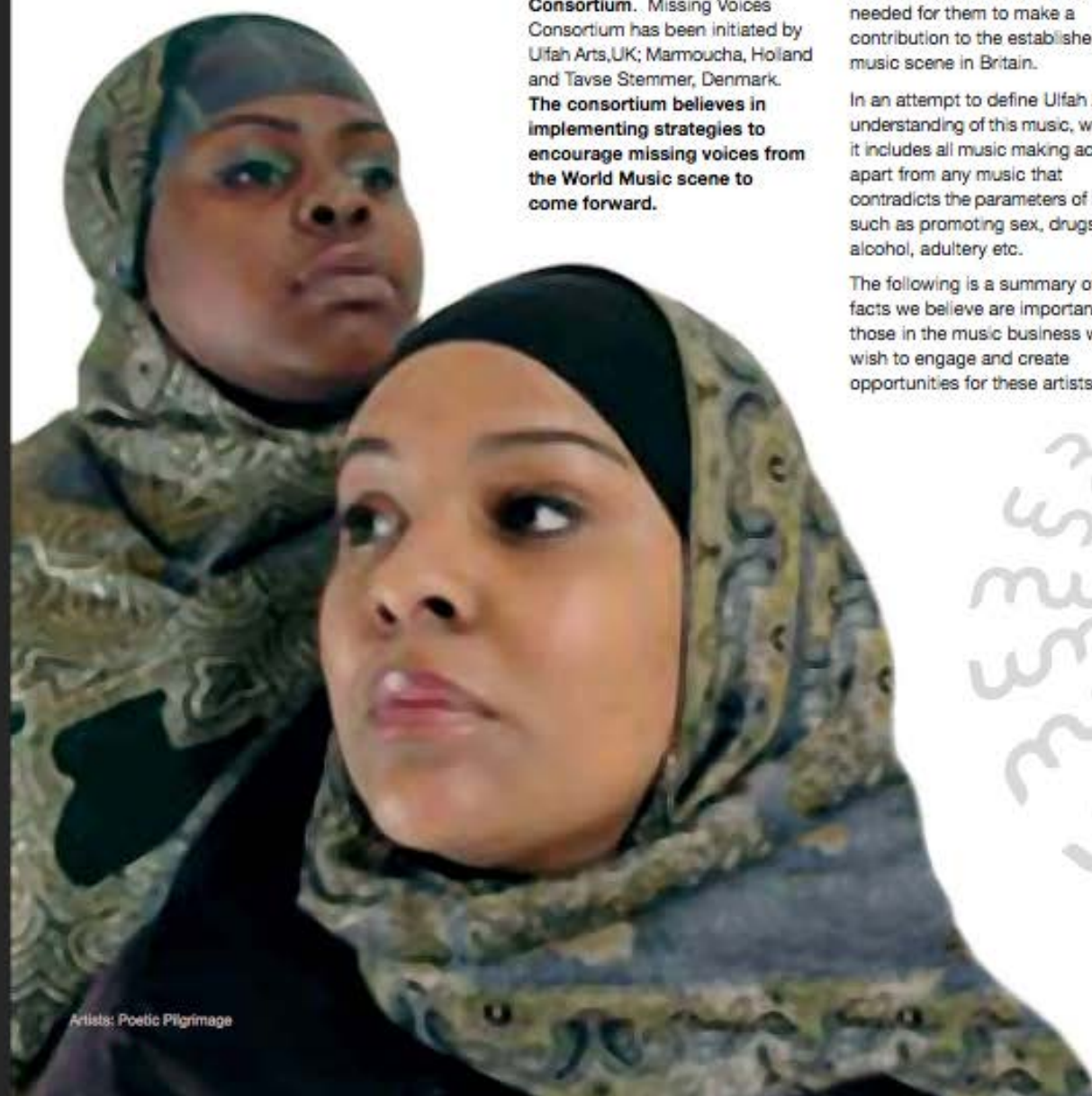
Artists: Poetic Pilgrimage

The following is a summary of key facts we believe are important for those in the music business who wish to engage and create opportunities for these artists.