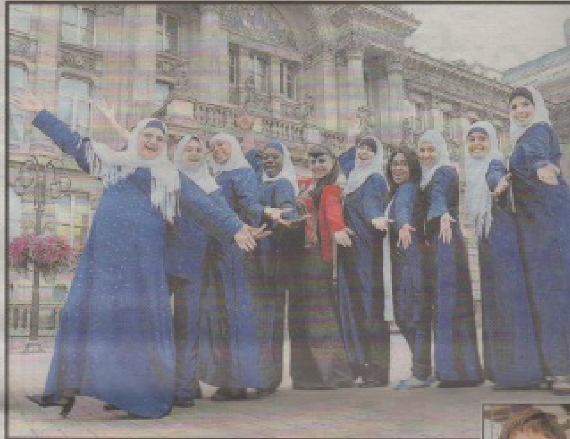
■ ON WITH THE SHOW... Uthah Collective will share the stage with Robin Gibb (right).

The group organise their rehearsals around prayer time